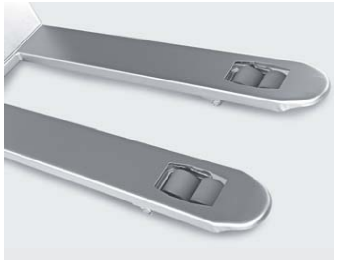
Easy pallet pick-up: fast and precise work thanks to rounded fork tips (optionally available with tandem rollers)