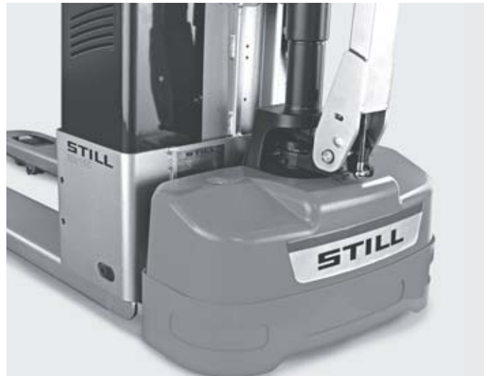
Safe on the road: the low chassis ensures maximum operating safety