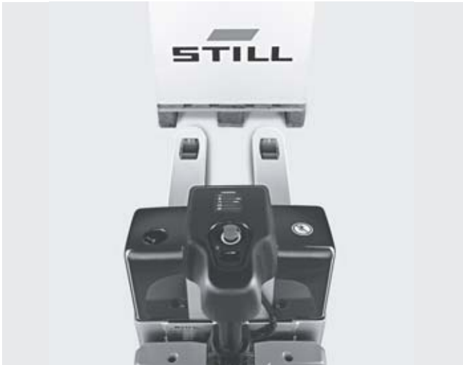
Best performance and view of the forks due to the structure's low height