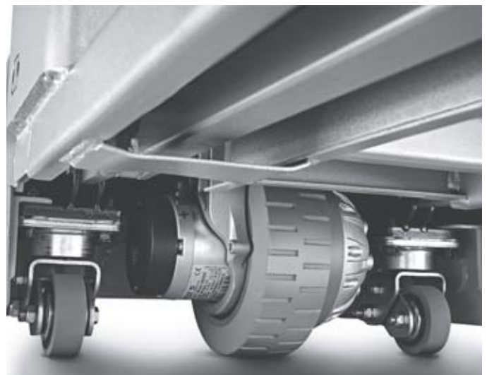
Optimum traction and castor wheels for perfect stability