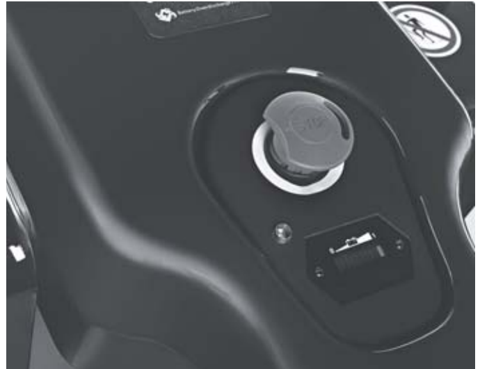
Always informed: the display shows the charging level