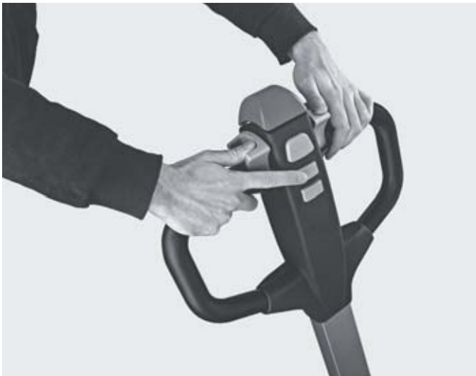
No need to change grip: comfortable control with one hand only – either left or right