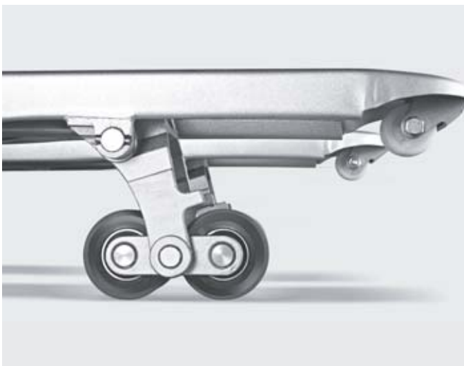
Easy pick-up: the standard entry rollers make picking up pallets crosswise a cakewalk