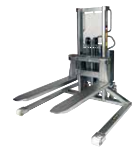
The stainless stacker with straddle legs can handle many different pallet types, also closed pallets.