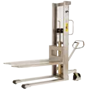
Also available with electric lifting or as explosion proof (manual