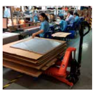
The manual highlifter needs very low power for the pump function and has foot protection and neutral position.