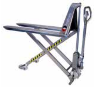
Available as manual, electric, stainless and explosion proof.