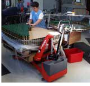
The emergency stop is centrally placed on the electric highlifter. The forks stop quickly and precisely.