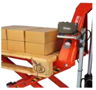
Level control (optional extra) ensures a constant working height.