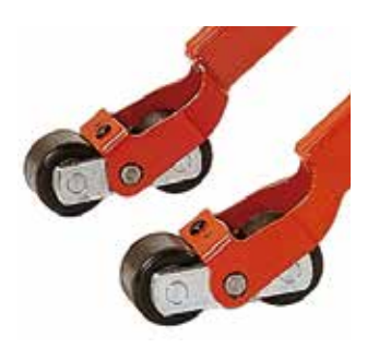
The tandem wheels have a brake effect and are gentle to the floor.