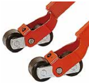
The tandem wheels have a brake effect and are gentle to the floor.