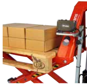
Level control (optional extra) ensures a constant working height.