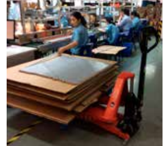
The manual highlifter needs very low power for the pump function and has foot protection and neutral position.