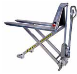
Available as manual, electric, stainless and explosion proof.