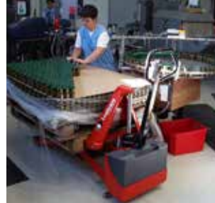
The emergency stop is centrally placed on the electric highlifter. The forks stop quickly and precisely.