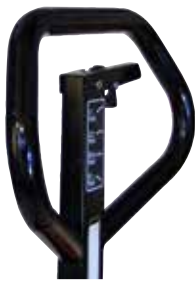
Ergonomic handle ensures the user a relaxed hold. Central location of all control buttons in the handle.