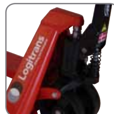
Permanent quick lift.