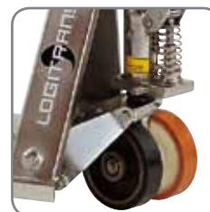
Different wheel types, to suit the needs of the user.