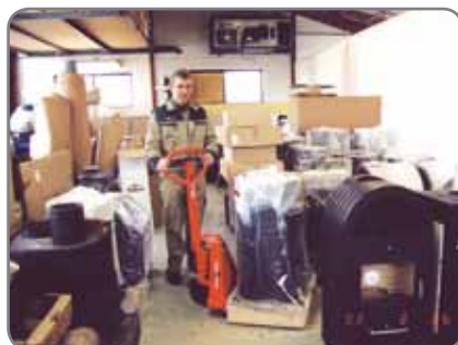
An easy handling of goods is ensured even in very confined spaces.