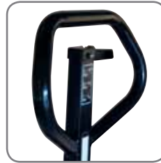
Ergonomic handle ensures the user a relaxed hold. Can be marked with name/department.

Stainless and explosion proof pallet trucks are also available.