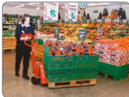
Adjustable fork height - no problems when handling low and worn pallets.