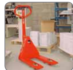
Panther is available with different fork lengths.