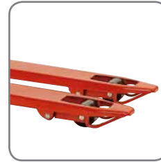
The hoop skates on the forks ensure an easy fork insertion and withdrawal in/out of pallets.