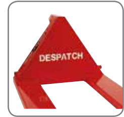
The company name or logo can be cut out in the triangle of the Panther.